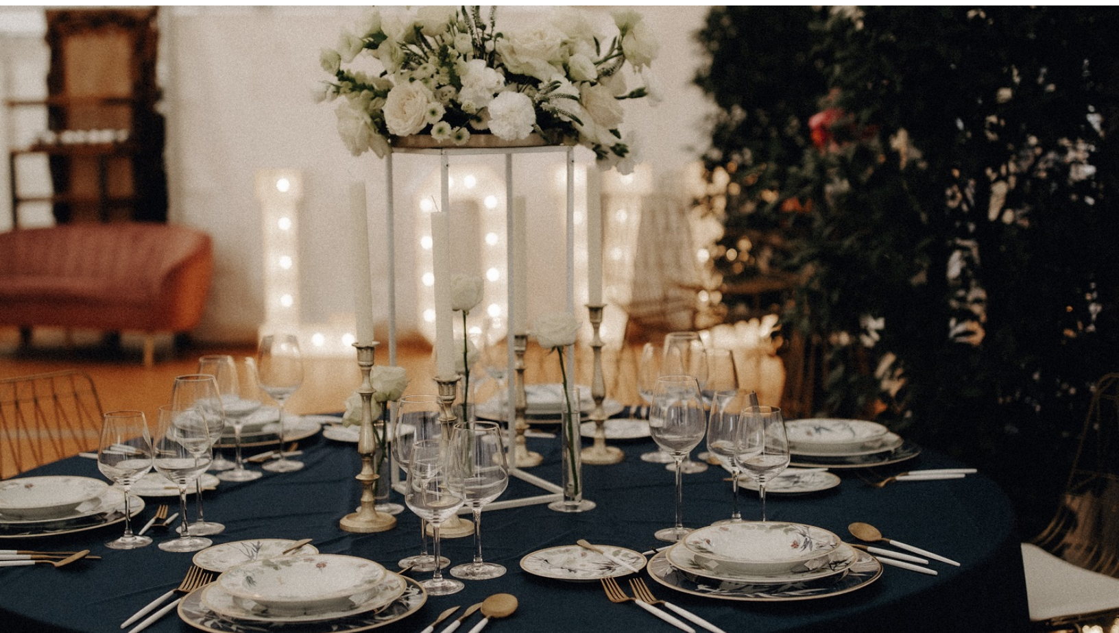
Tablesetting with Rosenthal Turandot