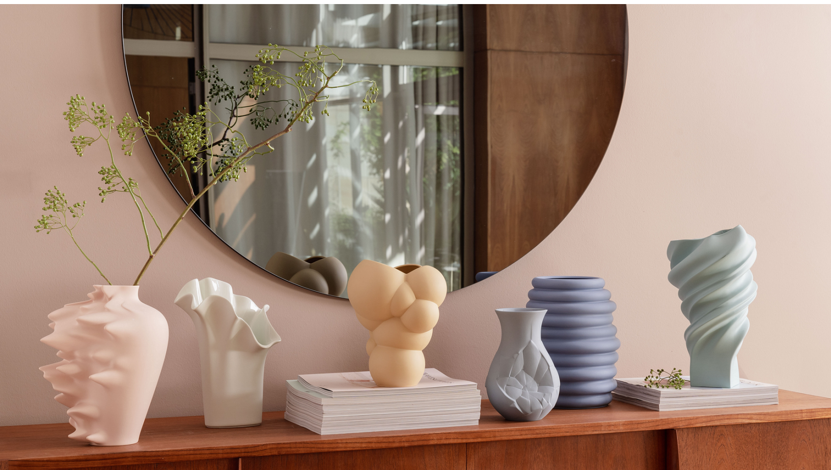
Rosenthal Design Vases+