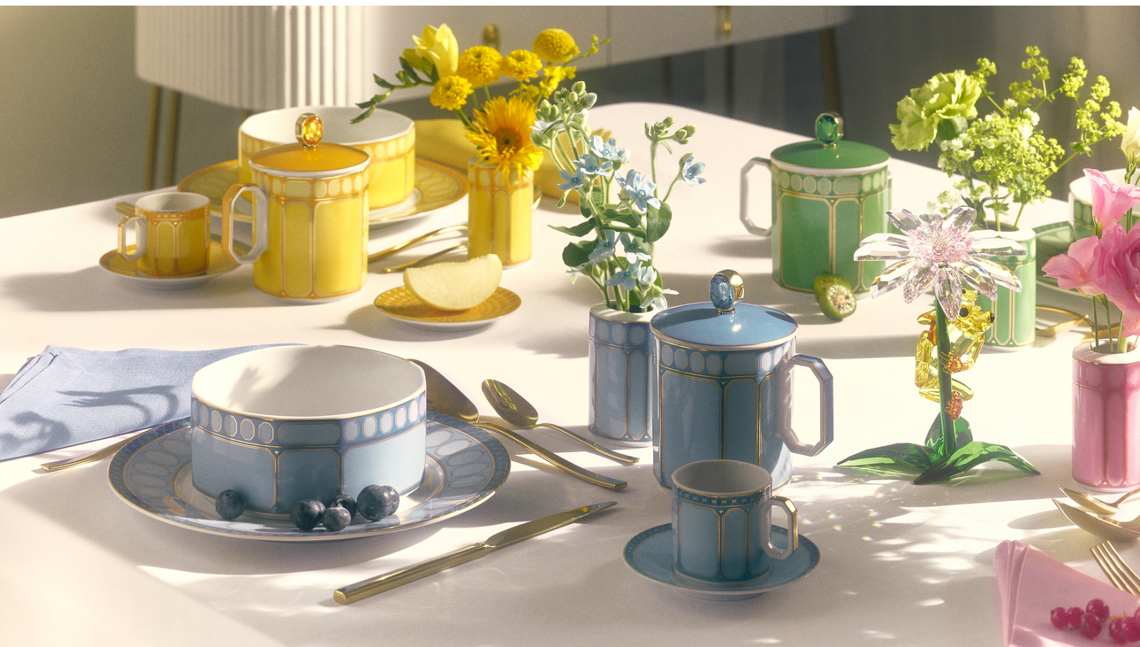
Swarovski x Rosenthal SIGNUM