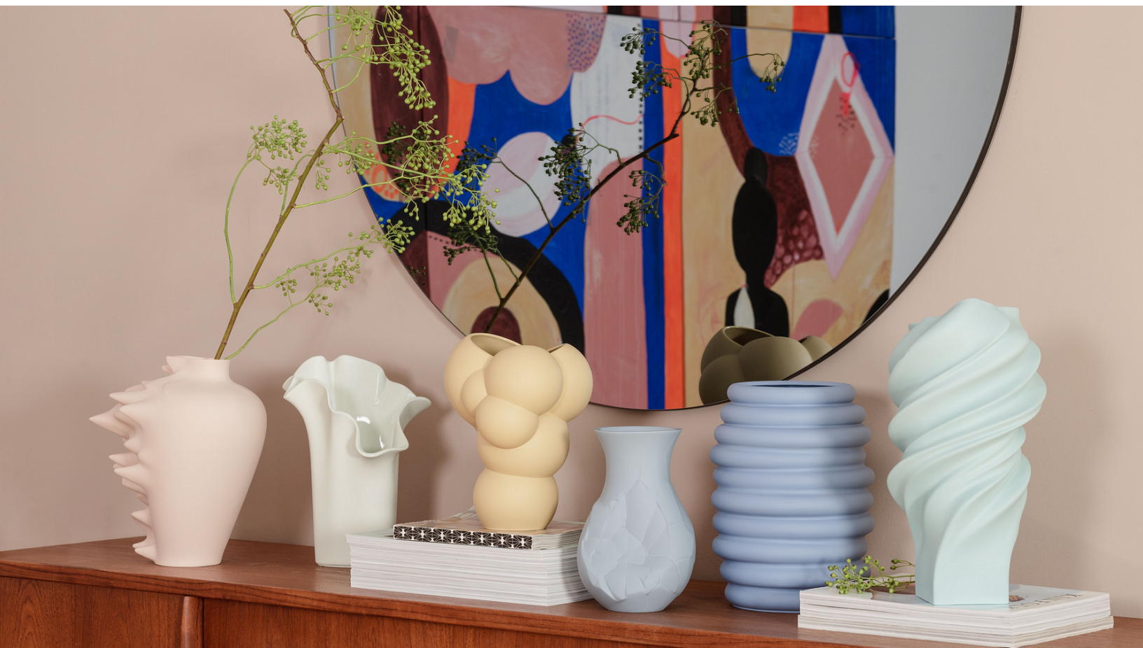
Rosenthal Design Vases+ in new colour shades