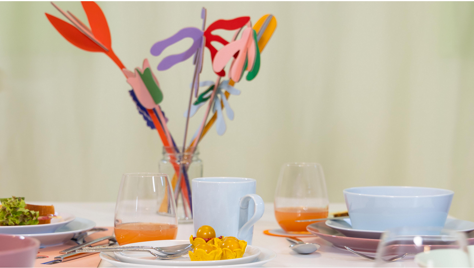
Thomas Collection Tric in new pastel colours