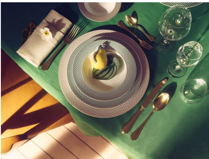
Stylish Bowls Made of Fine Glass Complement Dishes of All Kinds Rosenthal presents new glass bowls in Green, Pink, and Black

The new Francis Carreau Vert collection by Rosenthal draws inspiration from nature and showcases it with elegant forms. The bright green, gold-accented checkered patterns bring elegance and freshness to the table. With this collection, the Easter table is transformed into an exquisite feast.