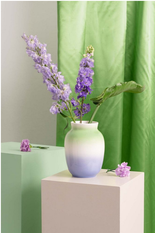
Francis Carreau Vert celebrates the trend colour Elegant, modern, and timeless design meets deep green.

The new Francis Carreau Vert collection by Rosenthal draws inspiration from nature and showcases it with elegant forms. The bright green, gold-accented checkered patterns bring elegance and freshness to the table. With this collection, the Easter table is transformed into an exquisite feast.