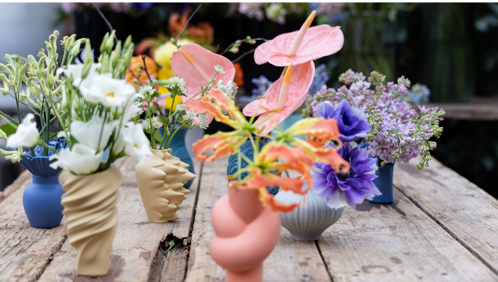
Rosenthal Mini Vases+